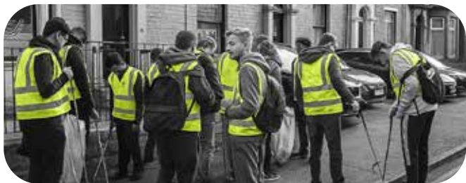
Community Clean Up 2 hours