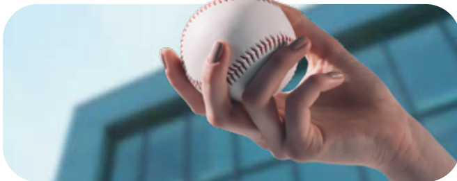
Rounders 1 hour TG